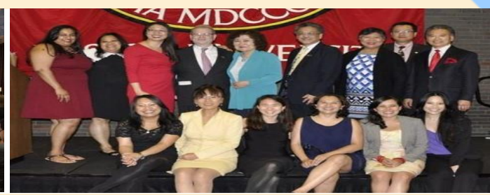
2016 AAC's Unity Dinner at Boston University