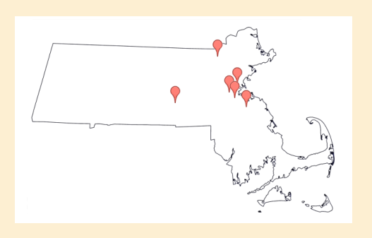
Six cities with the highest number of Asian Americans are Boston, Quincy, Lowell, Cambridge, Malden, and Worcester.