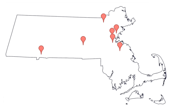
In 2014, the Commission brought its Resource Fair to Boston, Lowell, Malden, & Quincy. Other targeted areas are Lynn, Springfield, and Worcester.